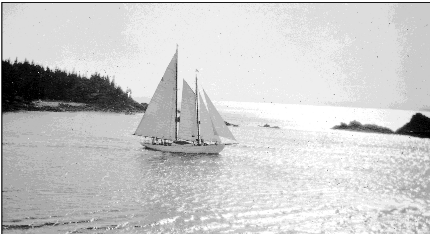
In 1933, President Roosevelt made the first of three visits to Pulpit Harbor. FDR was aboard the yacht AMBERJACK II on his way to Campobello Island.